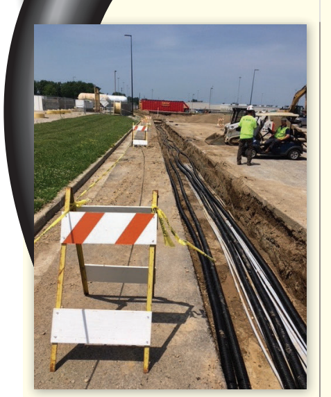
300ft trench with (5) runs of 2" DoubleTrac