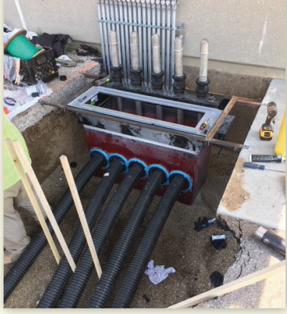
Transition sump that will transition from 2" DoubleTrac to ridged piping.