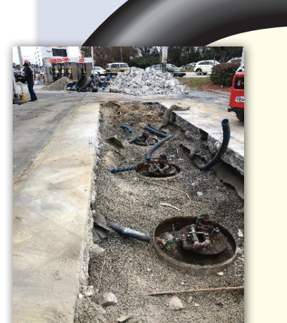
Exposed Tank Field with old flexible fuel piping removed