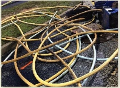
Removed Failed Flexible Fuel Piping